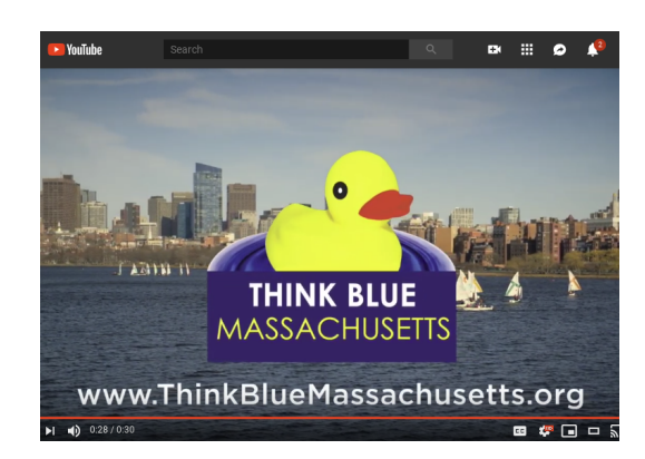
View the ad at <a href="http://bit.ly/tbm-fowl-water">http://bit.ly/tbm-fowl-water</a>

This effort helps coalition members meet their requirements to "document in each annual report the messages for each audience; the method of distribution; the measures/methods used to assess the effectiveness of the messages, and the method/measures used to assess the overall effectiveness of the education program."